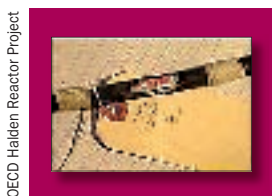
OECD Halden Reactor Project